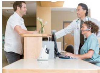
Stored and charged at nurse station