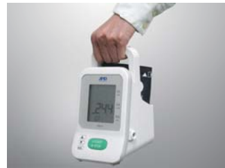
Easy to carry