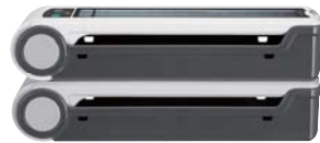
Flat base for stacking multiple units