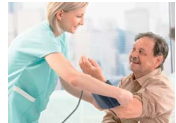
Measurement at ward