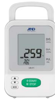
Stand-by display (Room temperature)