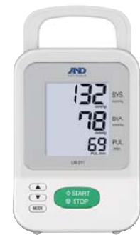
Measurement display (with backlight)